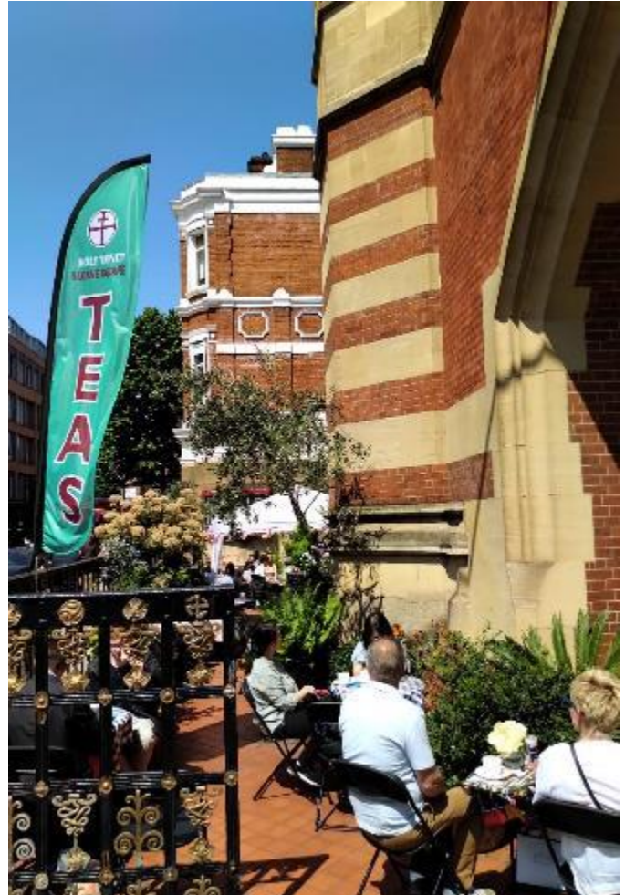
Visitors enjoying the patio garden tea shop during Chelsea Flower Show

The 5 th Earl Cadogan commissioned the architect John Dando Sedding to design the new Holy Trinity Church. The foundation stone was laid by Lady Cadogan on Ascension Day 1889 and the church was consecrated by the Bishop of London on 13th May 1890. The roof was destroyed by incendiary bombs in the Second World War. The damage was considerable, but the stained-glass windows withstood the blast and were undamaged.