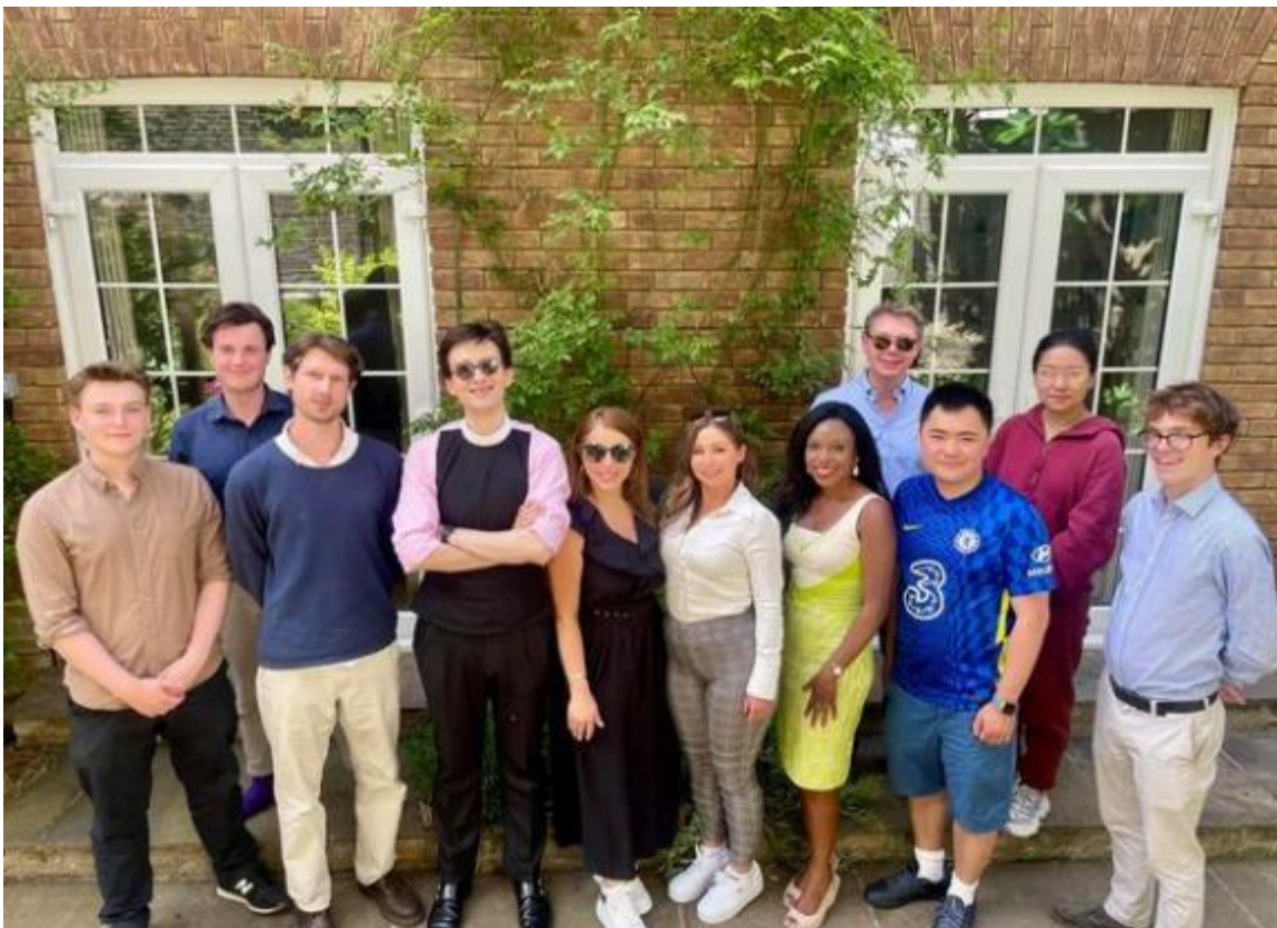
"Young Peoples" Lunch in Rectory Garden

On the first floor there are two bedrooms, one ensuite. On the second floor there are three bedrooms and bathroom/toilet. The sizeable and recently refurbished stone courtyard garden has often been used in the past for parish get togethers.