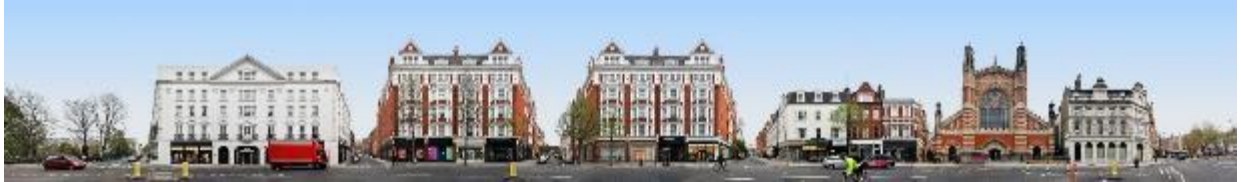
Sloane Street with Holy Trinity to the right, the Rectory is at the end of the road to the left large white building.

Bridge Road forming its central axis. In 2012, the parishes of Holy Trinity, Upper Chelsea, and St Saviour, Upper Chelsea merged to create the present parish. Holy Trinity Church is situated on Sloane Street, while the church of St Saviour can be found in Walton Place. The Patron of the parish is The Rt Hon the Earl Cadogan DL.