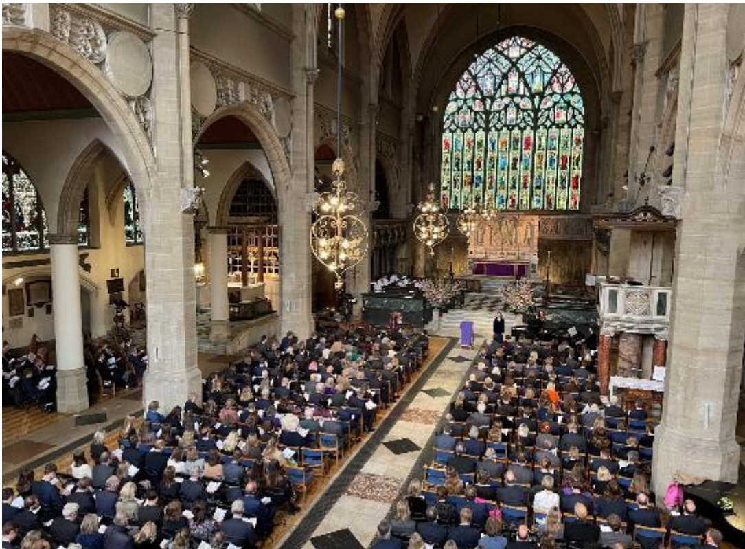
The congregation gather for a Memorial Service