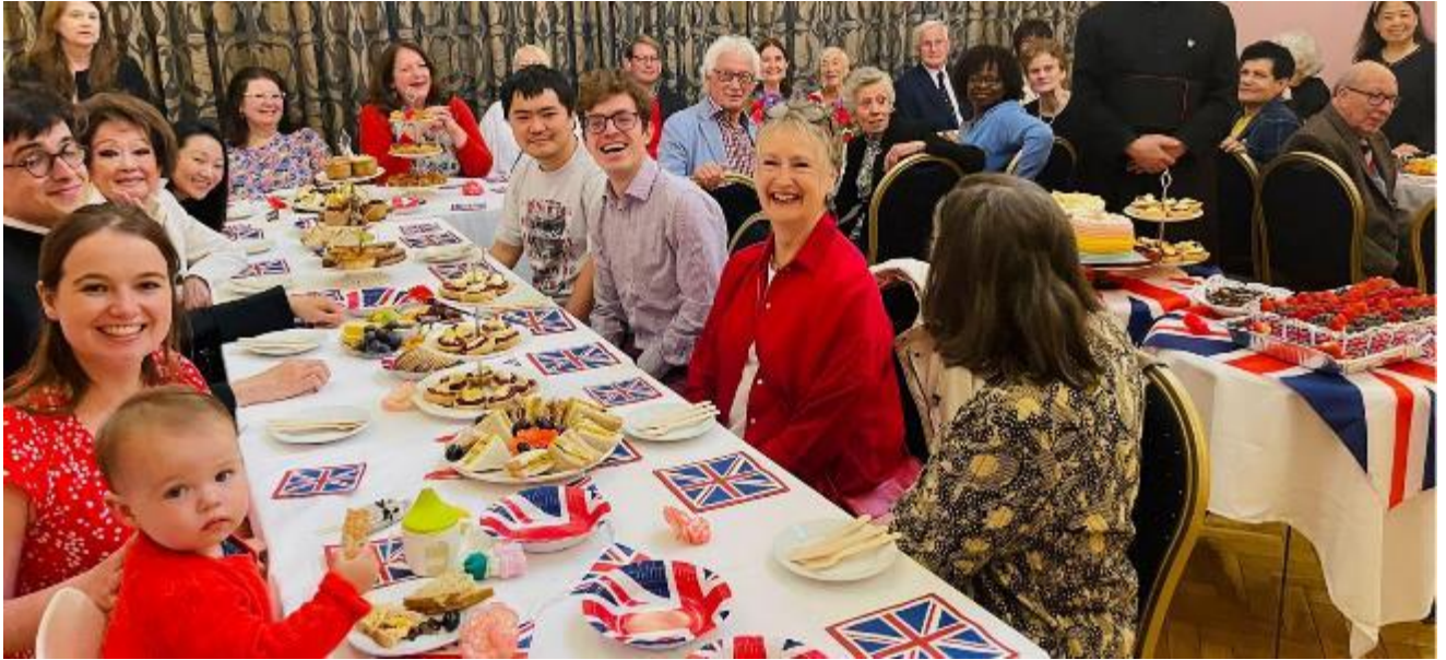
A tea party to celebrate the Queen's Platinum Jubilee

In 2018 a survey of regular worshippers revealed four main reasons for continuing to attend Holy Trinity, Sloane Square. The outstanding quality of: