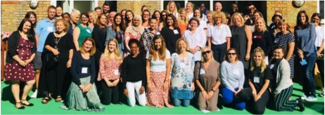
Holy Trinity School Staff

Holy Trinity is privileged to provide three school governors, who play a key role in setting the educational and spiritual direction for the school. Two parishioners currently sit on the Board of Governors.