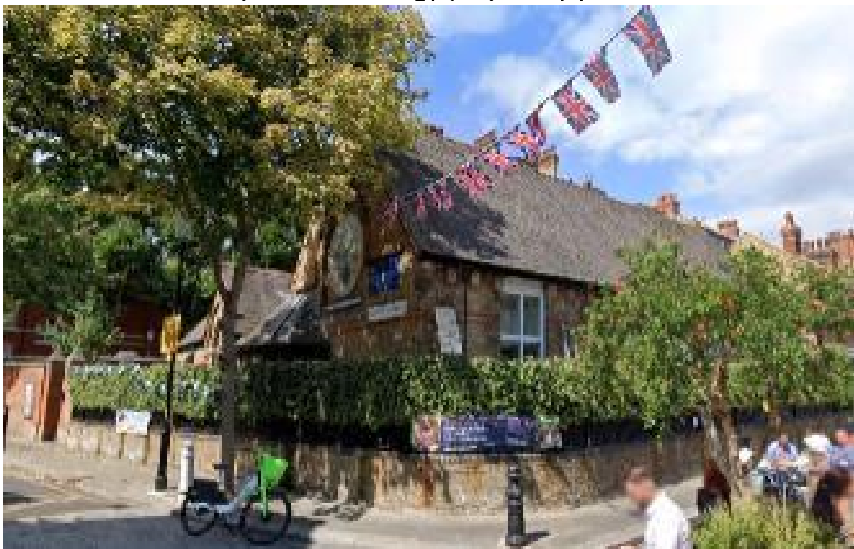
Holy Trinity School Cadogan Gardens Building