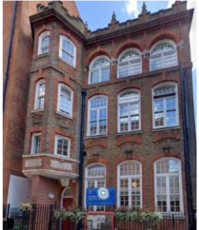
Holy Trinity School Sedding Street Building

This primary school is a key part of the parish's current mission and ministry. Holy Trinity Primary School is rated 'good' by Ofsted (April 2023), and is federated with Christ Church CoE Primary School (repeatedly rated 'outstanding' by Ofsted). The church actively supports and collaborates with both schools to emphasize spiritual and moral development among young people. This partnership centers on weekly assemblies delivered by the clergy and involves visits to the church and extra input from clergy in RE lessons. Every Friday the school come to Holy Trinity for the Special Mentions assembly, and the clergy play a key part in this.