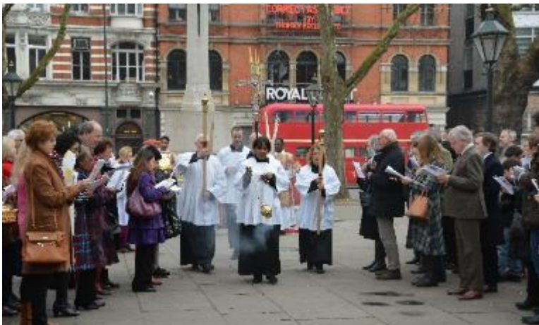
Remembrance service at the Sloane Square war memorial.