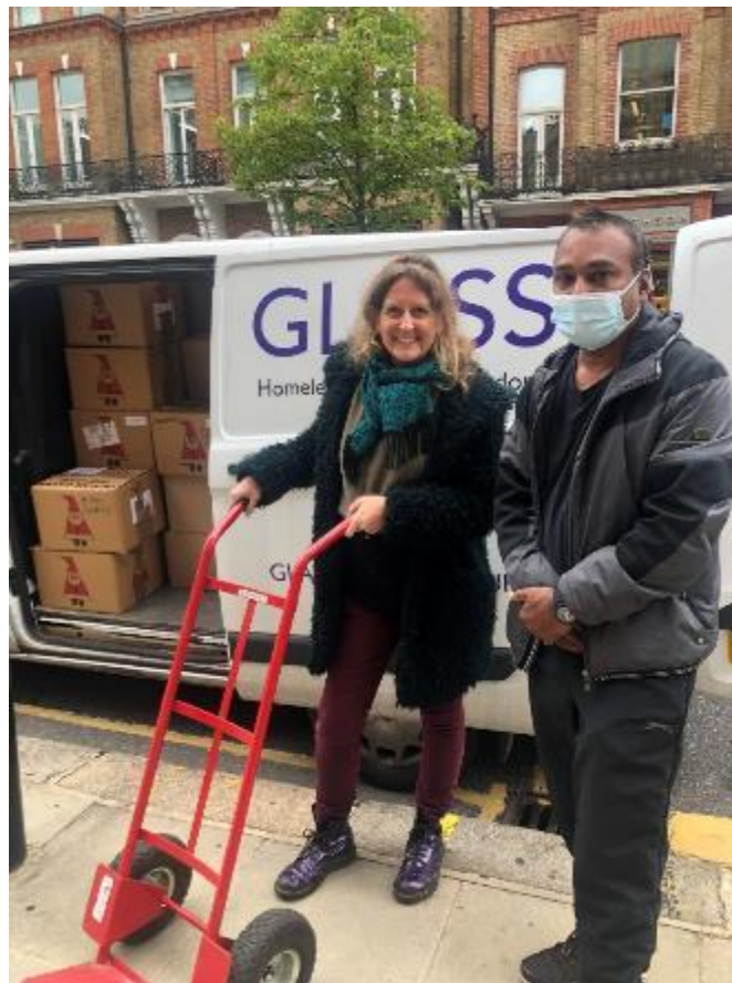
Harvest Festival donations go to the foodbank

We have a growing team of dedicated volunteers including a welcome team on the 'Welcome Desk', Servers, Readers, Intercessors, Stewards, a Cleaning Guild and Hospitality Team.