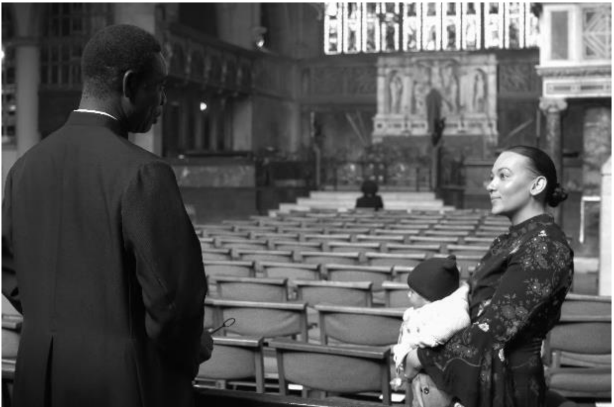
One of our servers meeting a mother before the baptism of her child