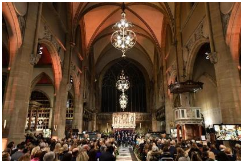
A charity Christmas concert

The Sloane Square Choral Society, though under the Parish umbrella, is directed separately with 85+ members who rehearse in the church every Monday evening and present three concerts annually.